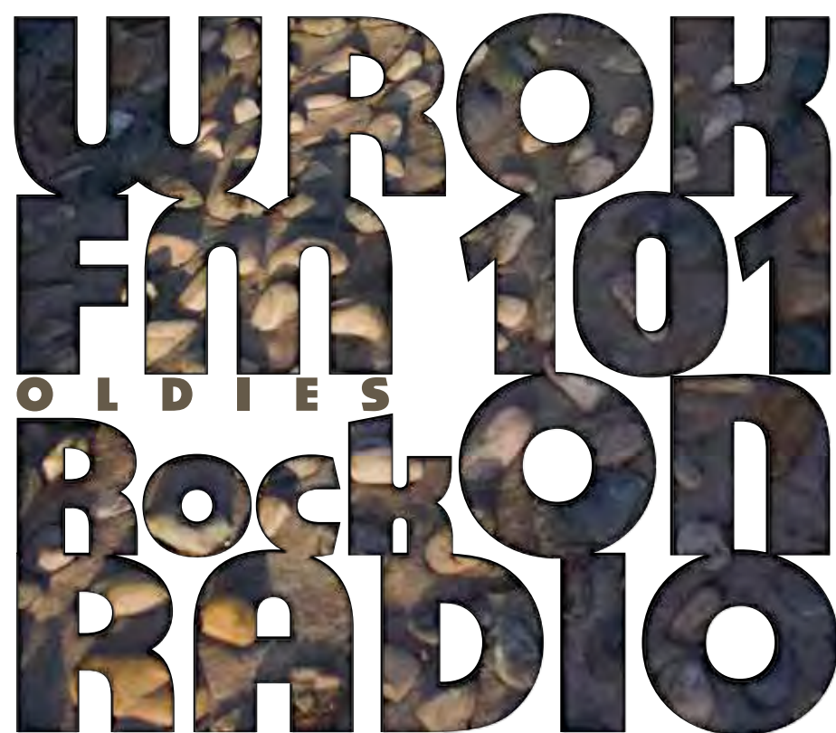
DEMONSTRATION LAYOUTS OF SEVERAL POSSIBLE USES FOR THE DEZ BOULDER TYPEFACE FAMILY.