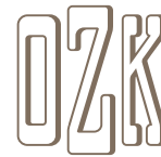
Type any lowercase + Capital + lowercase

The solid version of Neuport Monogram requires the Stylistic Alternates feature, available in most OpenType savvy applications, such as Adobe Illustrator CS (see Fig. 1). You can enable Stylistic Alternates and type out a monogram or text, or you can highlight an already setup outline monogram or text and enable Stylistic Alternates to change it to the solid style.