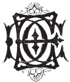
CDE keyboard key "g"