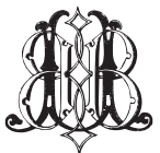
BBU keyboard key "H"