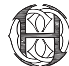
CCH keyboard key "u"