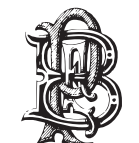
BFP keyboard key "Q"