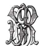
BRS keyboard key "T"