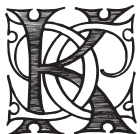
CCK keyboard key "c"