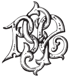
BEG keyboard key "C"