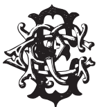
CCPE keyboard key "i"