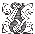
CCE keyboard key "a"