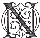
CCN keyboard key "m"