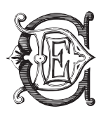
DDE keyboard key "q"