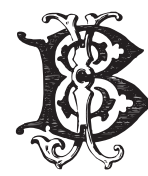
BI keyboard key "U"