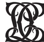
CCL keyboard key "w"