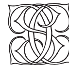
CCS keyboard key "y"