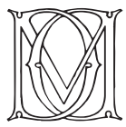
DDV keyboard key "K"