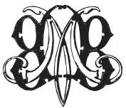
BBM keyboard key "F"