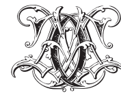
CCAA keyboard key "Z"