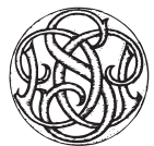
DDS keyboard key "r"