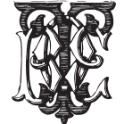
BEOT keyboard key "N"