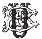
BFU keyboard key "I"