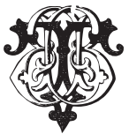
BBT keyboard key "E"