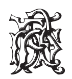
DDCHQ keyboard key "s"