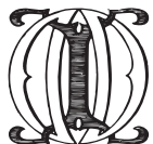
DDI keyboard key "l"